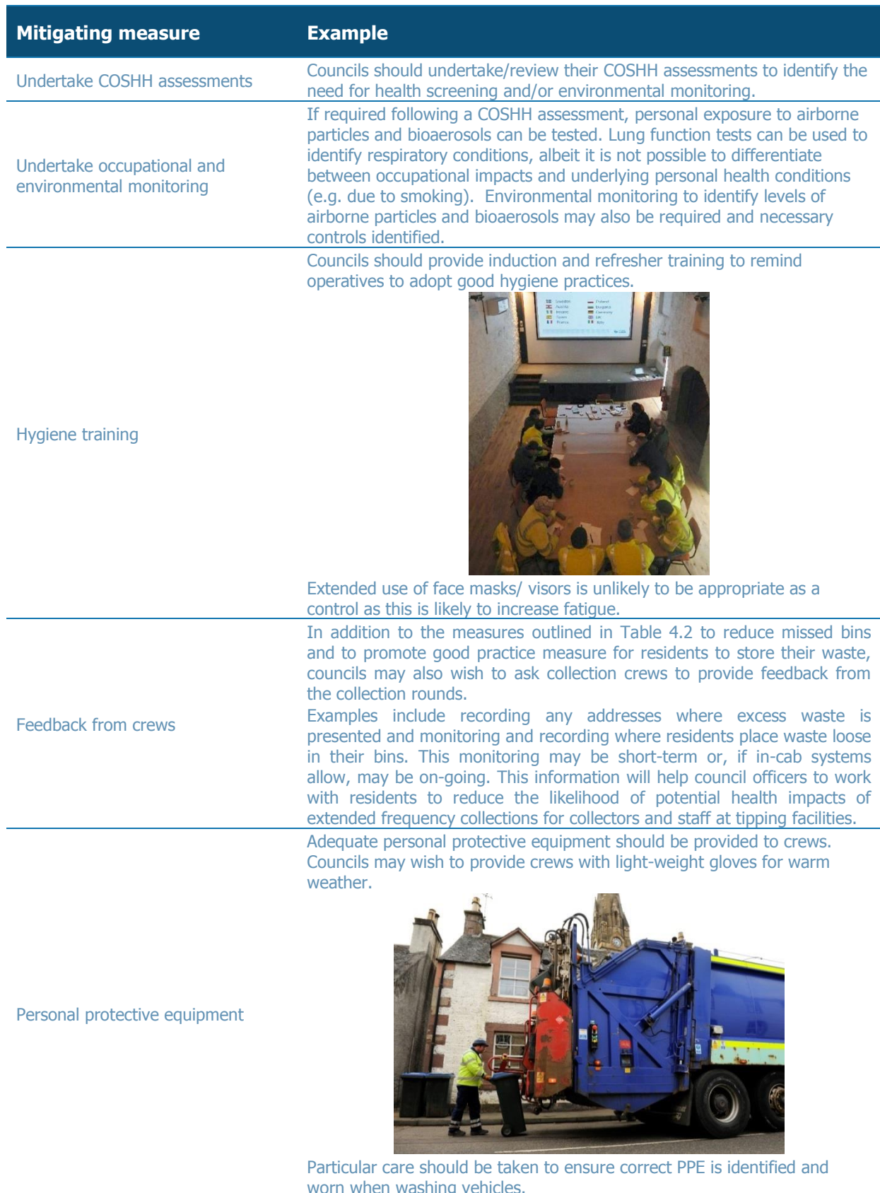
Table 4.5 Measures to reduce occupational health risk for collectors & staff at tipping facilities